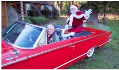
Santa arriving in his red sleigh