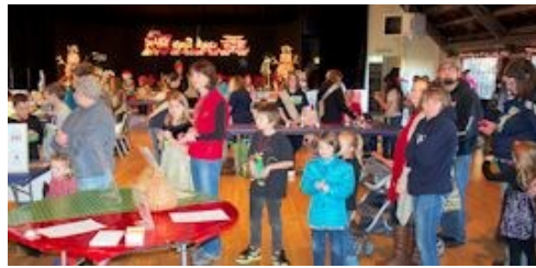
The Santa Line