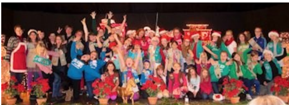
The scout troops