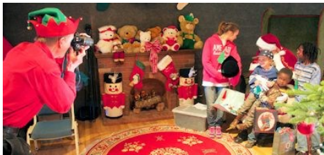
Posing for pictures