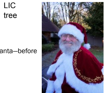
LIC tree Santa—before