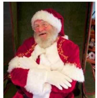
Santa—still smiling at the end.