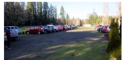
Full parking lot