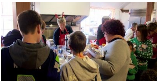
The food line