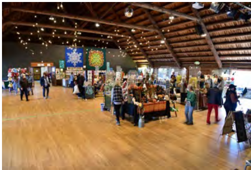
Fiber Arts & Farm Tour

Respectfully submitted, Sheryl Low LIC Secretary