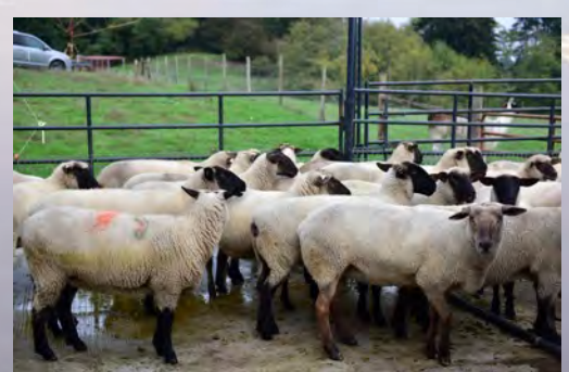
Fiber Arts & Farm Tour