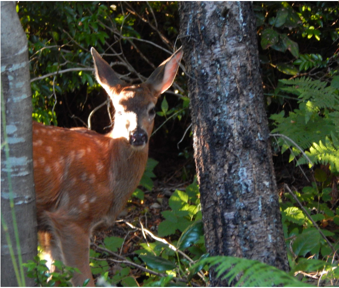
No one sent me a picture, so thought I might send one of my recent visitors-eyeballing my garden!! - Helen