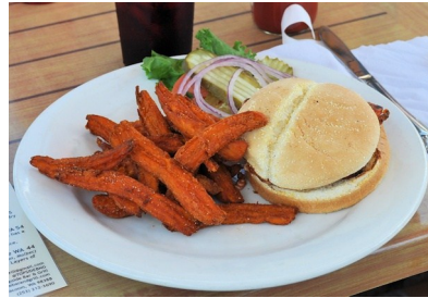
Look at those sweet potato fries!! Docked in Steilacoom at low tide!