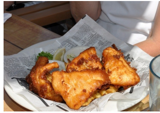
Fish & Chips Salmon salad