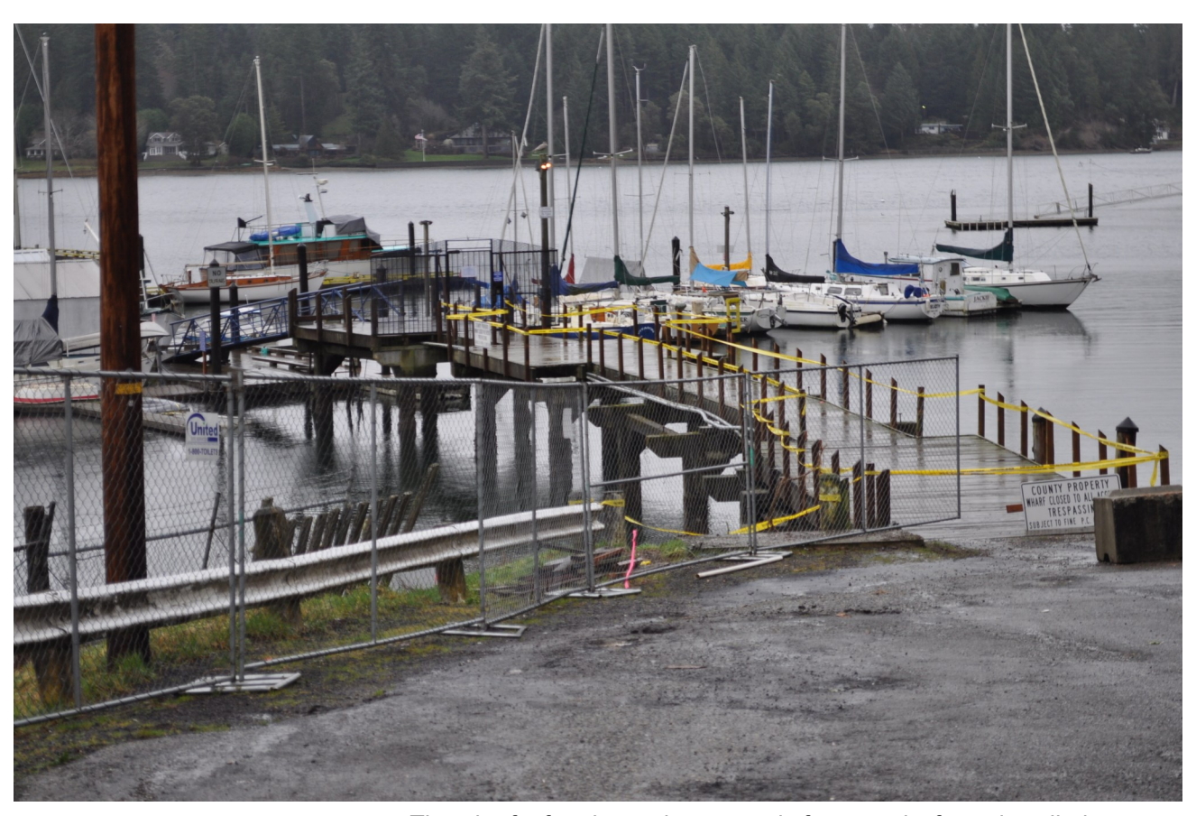
The wharf, after the work party and after security fence installed Photo taken by Lynn Carr, January 21, 2011

Sandy Black, Events Chair 884-1309, swblack1216@centurytel.net