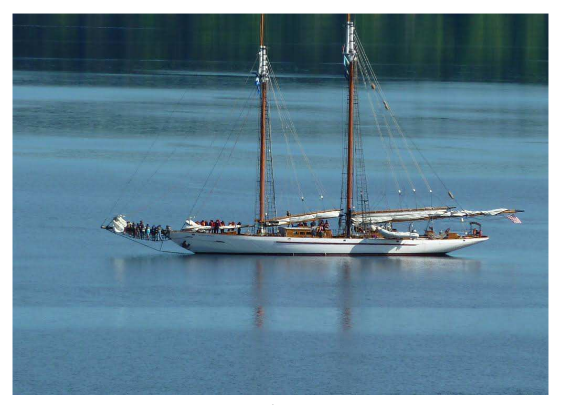
The Adventuress visits Filucy Bay (with an all-female crew)