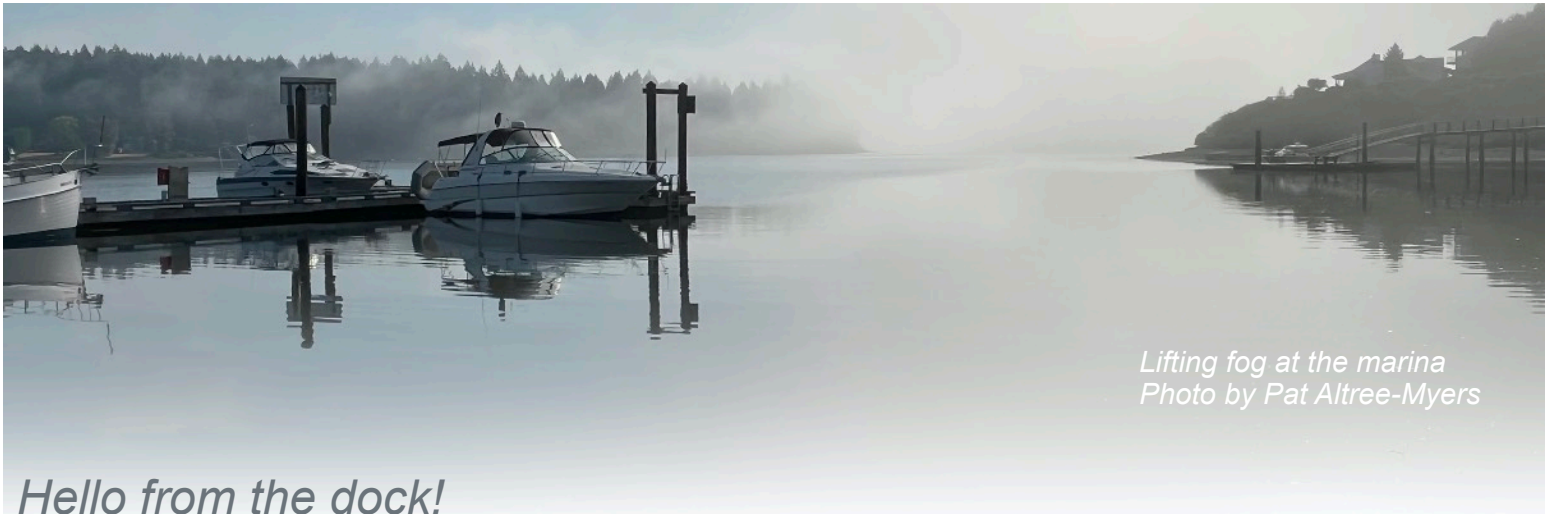
Lifting fog at the marina