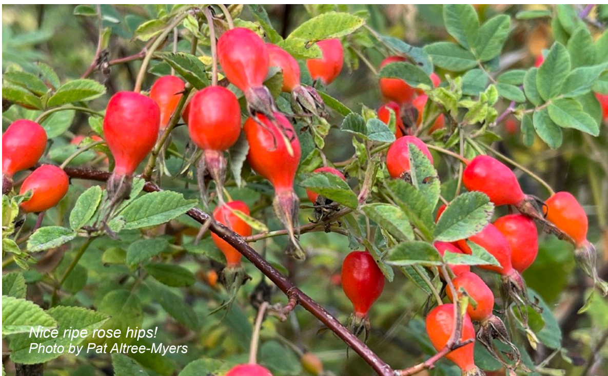
Nice ripe rose hips!

Respectfully submitted by Xoe Frederick LIC Secretary