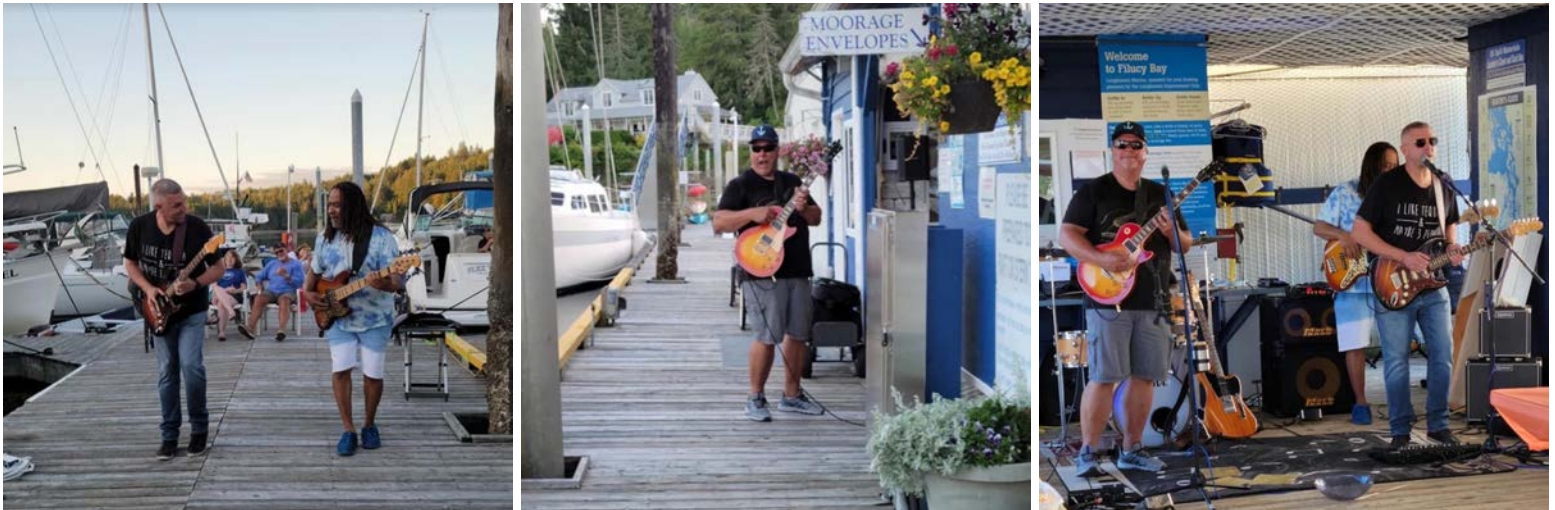
Enders Brothers Band

All marina tenants who are invoiced quarterly will receive your 3 rd quarter invoice in late June. Please make sure you pay by the 15 th of July to avoid a late payment fee that was approved by the Membership in the rules and regulations. Thanks!