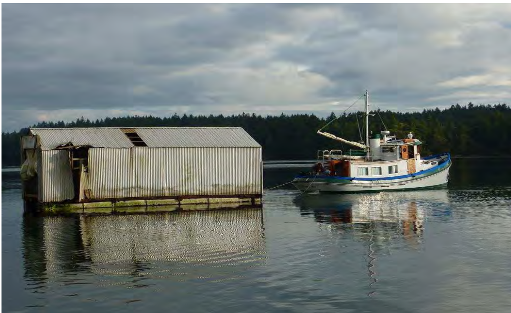
THANKS, RICH ! Boathouse removal