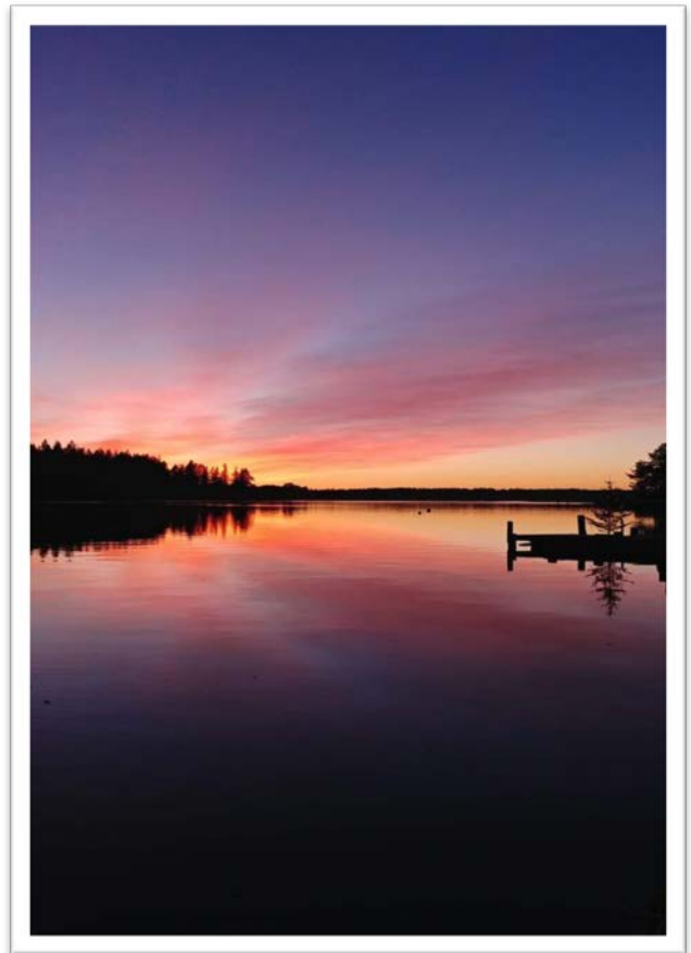
Another glorious Key Peninsula sunset.