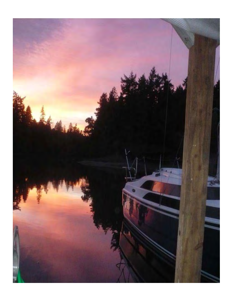
Longbranch Sunset- Lynn Lloyd