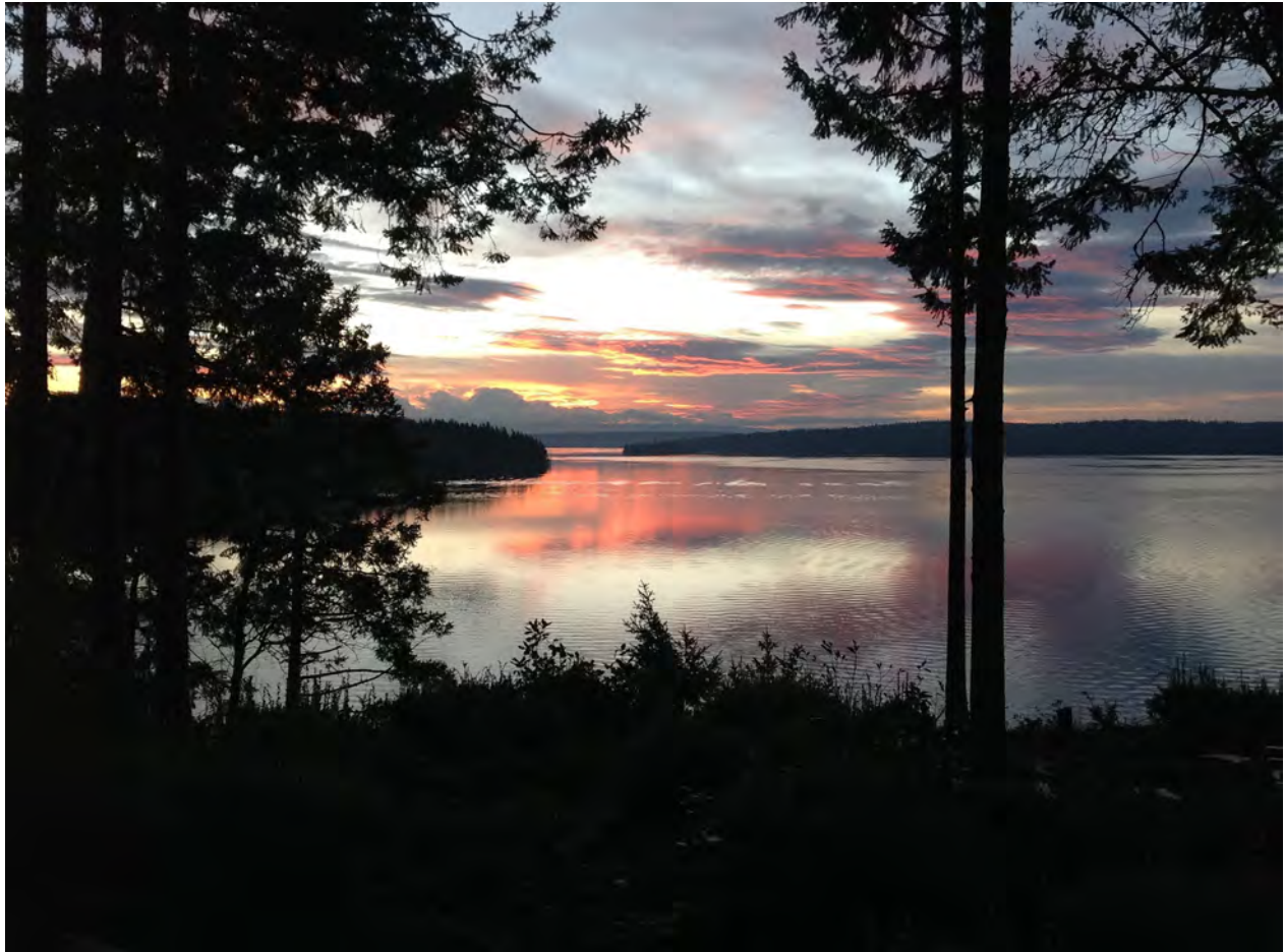
Sunset on Filucy Bay.