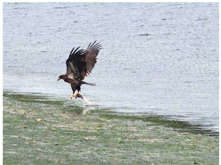
Crab for breakfast anyone. A day in the life of an eagle. A sight to see.

We have a pair of golden eagles visiting the marina – and what a sight they are. Even though we cannot hunt for crab, they can! Hope you have a chance to see them. Rich Hildahl has some fantastic pictures.