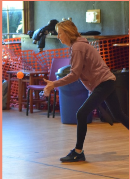
Pickleball fun