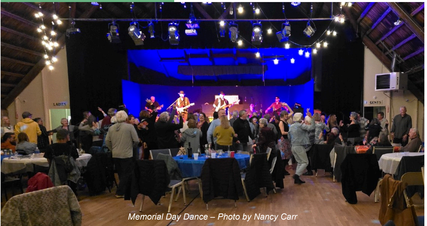
Memorial Day Dance