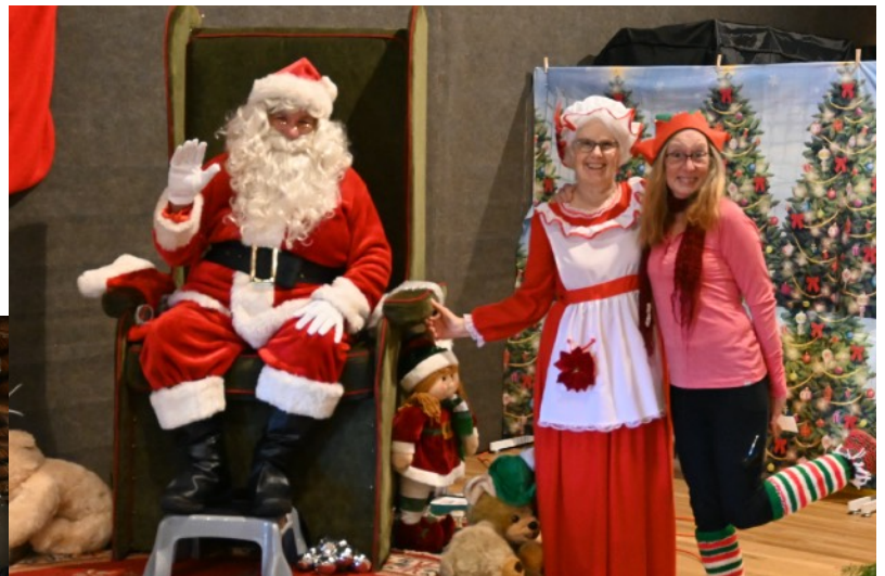
Kids & Christmas