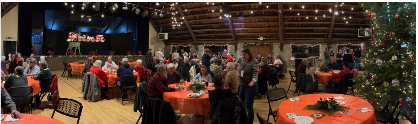
Membership Christmas Dinner