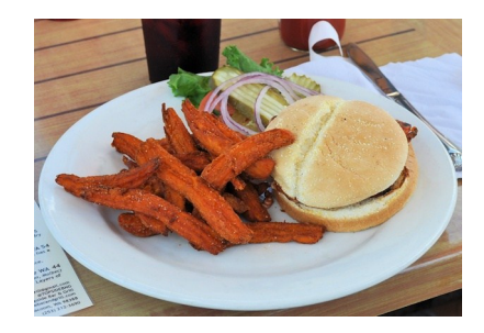
Look at those sweet potato fries!! Docked in Steilacoom at low tide!