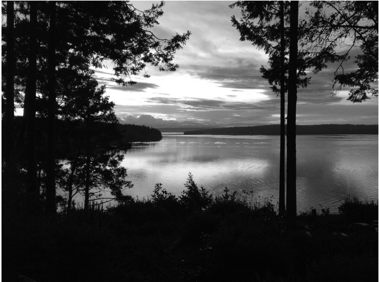
Sunset on Filucy Bay.