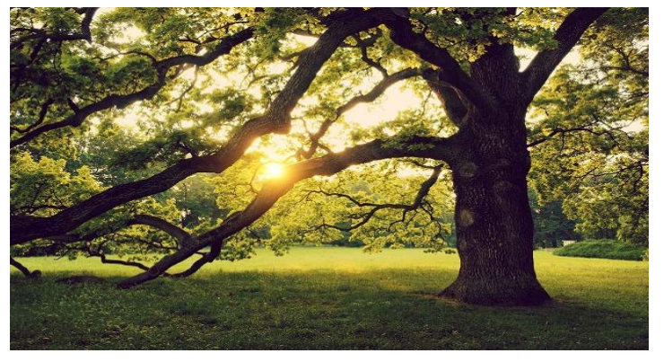
"The tallest Oak in the forest was once just a little nut that held its ground."

any questions, let us know and we will be happy to help. You may want to know how many hours and meetings you have before