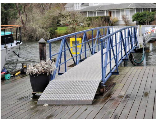
Normal high tide