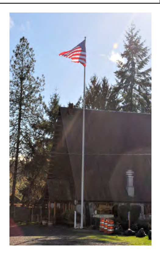
LIC Flag—during the Flag raising, and flying in the wind.